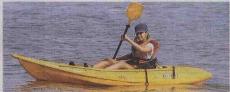
Clockwise from top: Wind surfing, kayaking and stand-up paddle surfing

The fee is Rs4,000 for five turns. It includes usage of the equipment. But if you want to buy your own equipment, you will have to shell out about Rs65,000. People across all age groups can enroll for SUP. The minimum age requirement is 10 years.